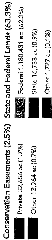
Exhibit A Garfield County Land Ownership

values are % of total acres (1,893,389) in Garfield county