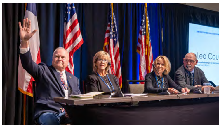
STOP 30 X 30 SUMMIT 2023